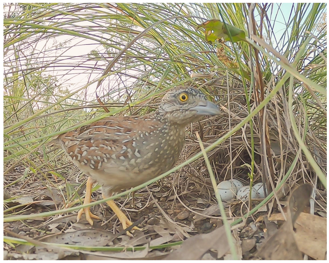
Figure 3. Adult male Chestnut-backed Button-quail returning to his nest at Wongalara Sanctuary, Northern Territory.

Figure 2. Nest of Chestnut-backed Button-quail at Australian Wildlife Conservancy's Wongalara Sanctuary, Northern Territory. Open savanna woodland in which the nest was detected (left), location of nest under perennial grass tussock (centre) and domed nest with four eggs (grass parted for photograph) (right).