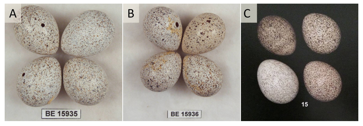
Figure 5. (A) and (B) Clutches of Painted Button-quail eggs held in NMV. (C) Purported clutch of Chestnut-backed Buttonquail eggs, depicted by Johnstone & Storr (1998); this clutch is comparable with those of the Painted Button-quail but not with confirmed Chestnut-backed Button-quail clutches (see Figure 4).