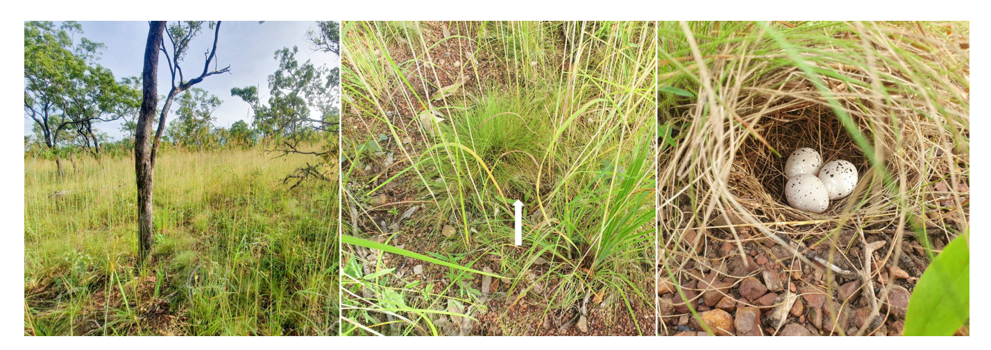
Figure 1. Nest of Chestnut-backed Button-quail at Pine Creek, Northern Territory. Open savanna woodland in which the nest was detected (left), location of nest under perennial grass tussock (centre), and domed nest with three eggs (grass parted for photograph) (right).

Three eggs were found in the Pine Creek nest and four in the Wongalara nest. The size, shape and coloration of the eggs were similar at the two sites. All eggs were rounded but pyriform in shape, being widest at one end and sharply tapered at the opposite end. The base colour of all eggs was a clean pure white, with a sparse covering of distinct small blotches of dark purple and brown, which appeared almost black. Fine flecks of light brown and greyish purple were present but sparsely scattered on the eggs' surface (Figures 4A–B).